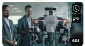
About LCAMP - The Learner Centric Advanced Manufacturing Platform