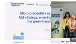
EARLALL at the European Week of Regions and Cities 2023