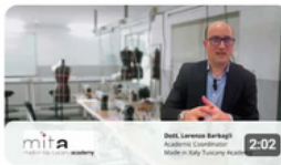
SKYLA Stakeholder Interview: Meet ITS MITA, Tuscany