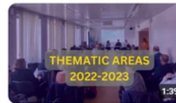
EARLALL Highlights from the Annual Report 2023