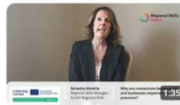
Interview with Dublin Regional Skills, Fingal Stakeholder