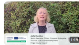
Interview with SKYLA partner: Fingal County Council