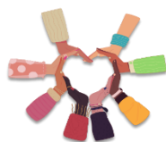
Inclusion and Outreach