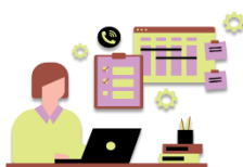
Technical staff capacity- building