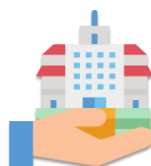
Institutional capacity- building