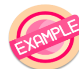
Set the example

Our network is flexible and tailored to address the capacity-building needs of our members. The benefits of joining the network include: