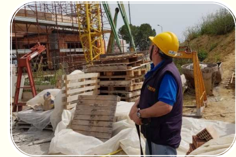
Construction companies employees