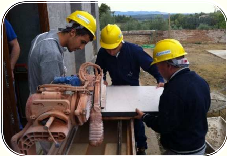
Young unemployed to be initiated into construction work