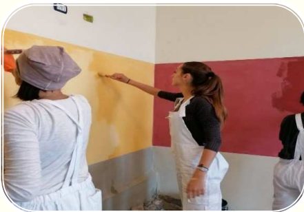
Female workforce to favor their insertion into the construction and decoration sector