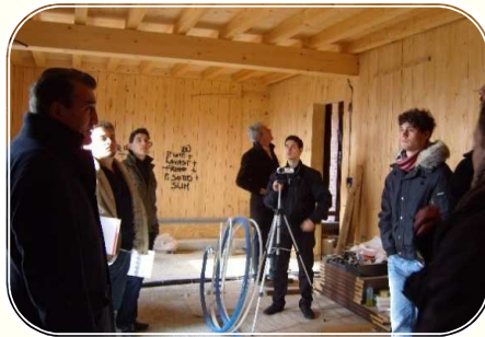
Just graduated and adult technicians