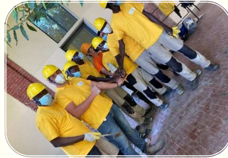
Weak groups: inmates, migrants and asylum seekers

Furthermore, enterprises can make use of the Building School of Siena to design and organize courses for the training of specific professionals and to develop topics of their interest