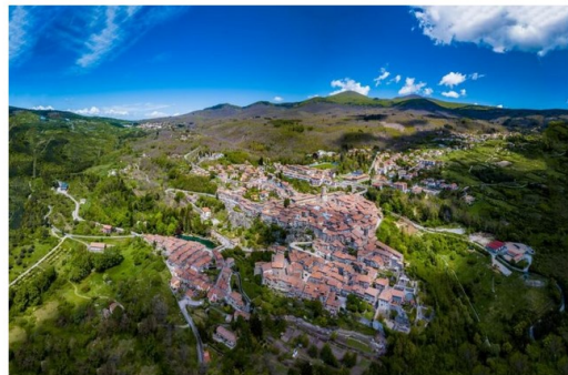
Comune di Santa Fiora - foto di Alfonso Fiorentino (pubblicata sulla pagina Facebook del comune)

A causa della pandemia da Covid-19, lo smart working (che sarà anche uno dei temi del Forbes Digital Revolution) continua inevitabilmente ad essere un elemento di discussione tra aziende e lavoratori. Alcuni lo vorrebbero per sempre, altri, invece, lo accetterebbero solo in un sistema ibrido: dove l'offerta dall'ufficio si coniuga indissolubilmente con l'online dello smartworking.